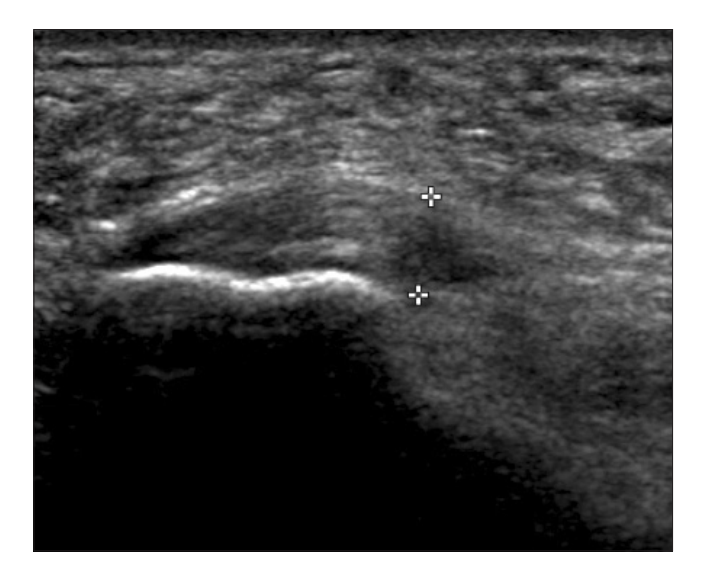
Fig. 2. Apparent ultrasonographic abnormal finding shows a plantar fascia thickness >3.8 mm.