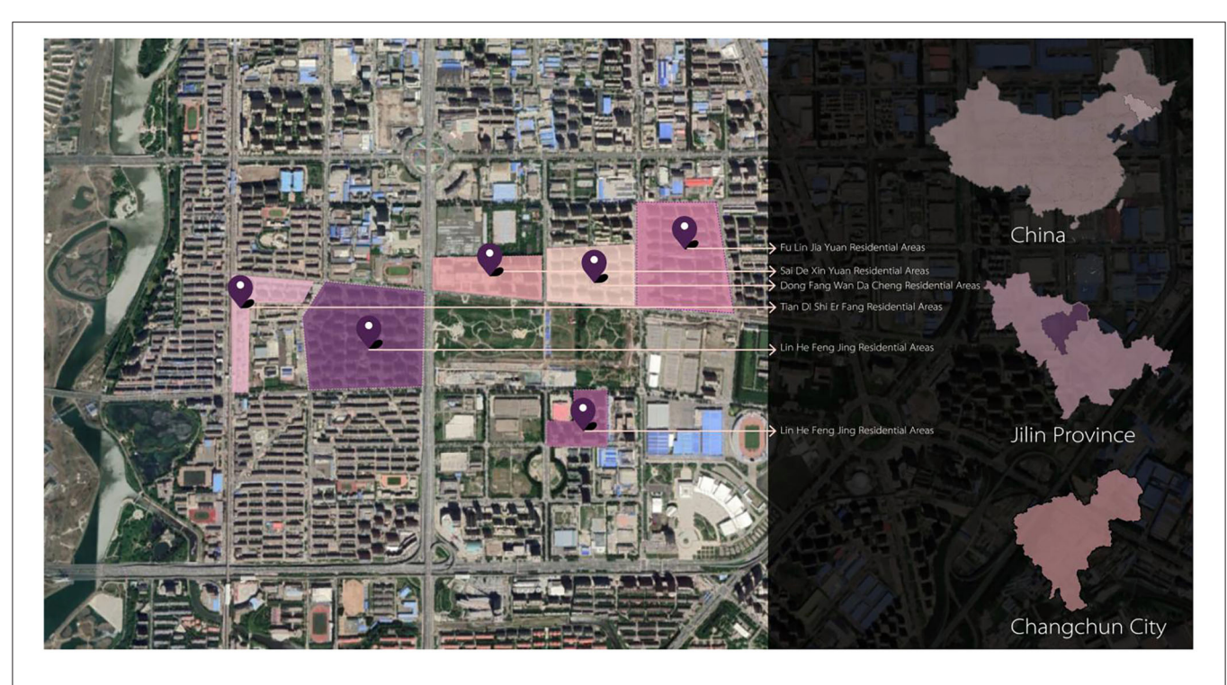
FIGURE 1 | Location and scope of the study.