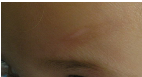
Figure 1 Skin lesion on the frontal area of the face, mechanically induced by a toy, in a 4-year-old girl.

Acne excoriata is considered by several authors to be the same entity as skin picking syndrome, 2 although there is