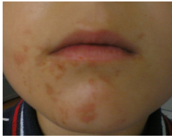
Figure 2 Pigmented post-inflammatory lesions on the chin of a small boy, induced by continuously rubbing the area with marker pens.

ongoing discussion with regards to the identification of these entities (Figure 4).