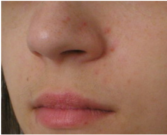
Figure 4 Acne excoriata (self-induced lesions on the face using a magnifying mirror).

anxiety, body obsessive–compulsive disorder, body dysmorphic disorder, borderline personality disorder, and hypochondriasis. 6 It is very important for the child that family members accept the psychiatric nature of this skin disease and undertake psychiatric treatment.