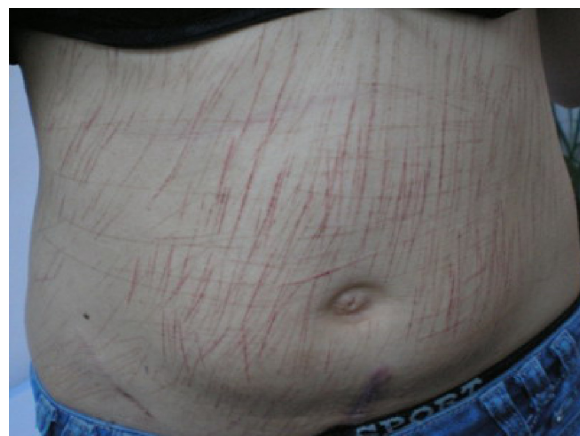
Figure 3 Self-induced cutaneous lesions on a 14-year-old girl's stomach inflicted by a sharp pencil.

Psychiatric examination and treatment is mandatory because neurotic excoriations can be the first sign of an extensive list of psychiatric disorders, including depression,