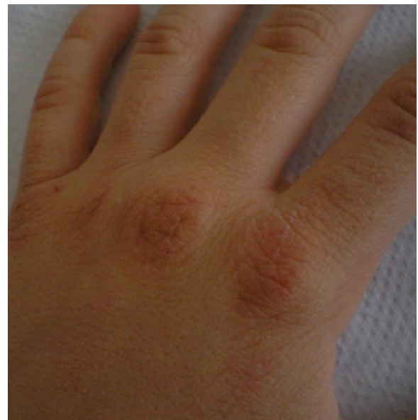
Figure 6 Pseudoknuckle pads on the left hand of an 11-year-boy with severe mental retardation.

Onychophagia is nail biting or chewing with swallowing of nail fragments, and is often diagnosed in children. In small children, onychophagia can be associated with thumb-sucking