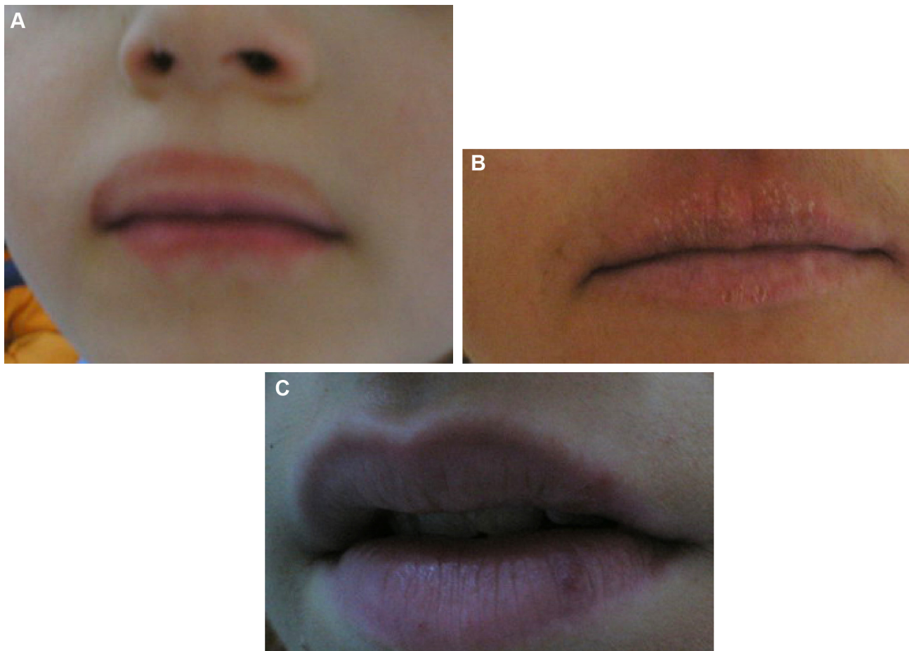
Figure 7 (A) Lip-lickers dermatitis in a 4-year-old boy. (B) Cheilitis artefacta in a 14-year-old girl with secondary eczematization. (C) Small ulcerations on the lower lip of an 8-year-old girl, self-induced by biting.

or secondary irritant dermatitis, infection, inflammation, and even malformation of the digits. It results from stressful situations and does not require a psychiatric evaluation in all situations. Onychotillomania refers to a self-induced nail disease brought on by chronic traumatization of the nail, also involving the paronychia and cuticle, with a variable degree of severity (Figure 8). Onychotemnomania is the result of cutting the nails too short, with secondary trauma to the nails.