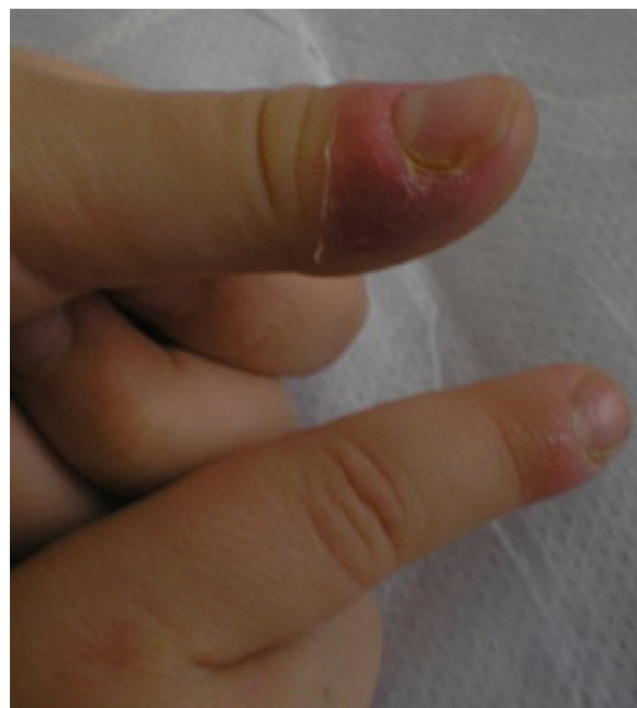
Figure 8 Onychophagia affecting the right hand and onychotillomania affecting the left thumb.

Psychodermatology is an expression of the interaction between skin and mind. It is of paramount importance for the clinician to establish an appropriate physician-patient-family relationship in order to diagnose and treat factitial skin diseases. Clues to the clinical diagnosis include bizarre, linear, or geometric features on accessible parts of the body, ambiguous history of lesions that are done by the patient for public eye. Skin injuries can be found on locations easily accessible for self-injury, ie, the face, trunk, and extremities.