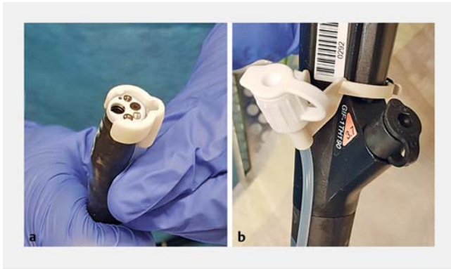
► Fig. 1 a AWC mounted on the tip of the endoscope with a freely adjustable distance to the regular working channel. b AWC-valve attached to the shaft of the endoscope.

To overcome these limitations, bimanual resection enabling traction and countertraction during resection appears helpful. This might be attempted using a dual-channel endoscope [5]. Similar to the cap-assisted method, a snare is introduced through one of the working channels of the endoscope. Grasping forceps introduced through the other channel can be used to pull the lesion into the snare loop [6]. However, the small distance between the two channels complicates the movement options and thereby reduces the effectiveness of the method.