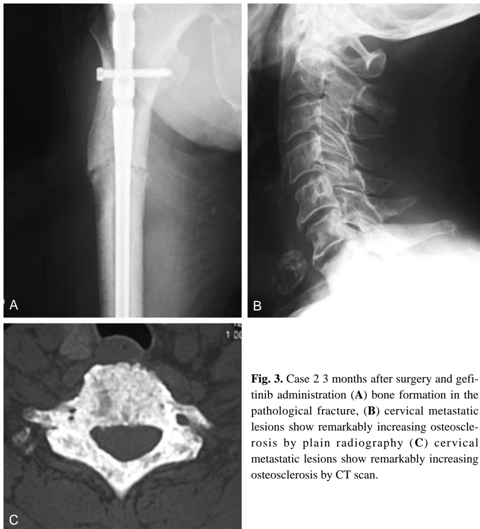
Fig. 3. Case 2 3 months after surgery and gefitinib administration (A) bone formation in the pathological fracture, (B) cervical metastatic lesions show remarkably increasing osteosclerosis by plain radiography (C) cervical metastatic lesions show remarkably increasing osteosclerosis by CT scan.