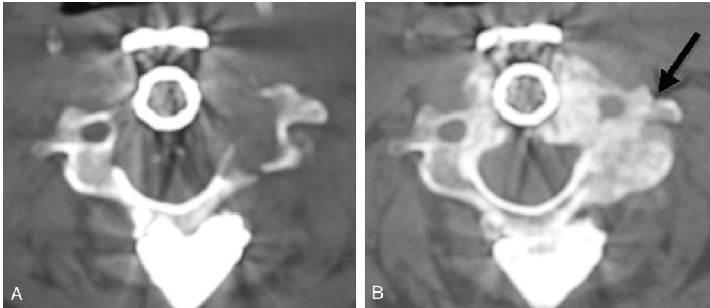
Fig. 2. CT scans showing osteosclerosis in the metastatic bone tumor area at C-5. (A) CT scans obtained immediately before gefitinib administration. (B) CT scans demonstrating remarkable bone formation at 3-months after gefitinib administration.

loss over a 3 month period. The plain radiographs and CT scan findings revealed a tumor in the left upper lobe of the lung. A pathological diagnosis by sputum suggested an ade-