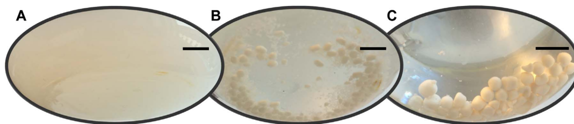
Fig. 3. Phenotypic appearance of KE6–12.A variants in shake flasks. A) KE6–12.A – non-flocculating, B) KE6–12.A expressing the strongly flocculating FLOI variant described in (Westman et al., 2014) and C) KE6–12.A expressing the chimaeric FLOW gene. Scale bars indicate ~10 mm.

cases, compared to expression of the ‘strongly flocculating’ FLOI variant, as shown in Fig. 3 for the KE6–12. A strain. The IBB10B05 strain behaved similarly. In-depth characterizations of the resulting strains are described in separate publications (Novy et al., 2017; Westman et al., 2017). The transferability of the cassette to other yeast strains clearly showed the robustness of the construct despite its considerable length.