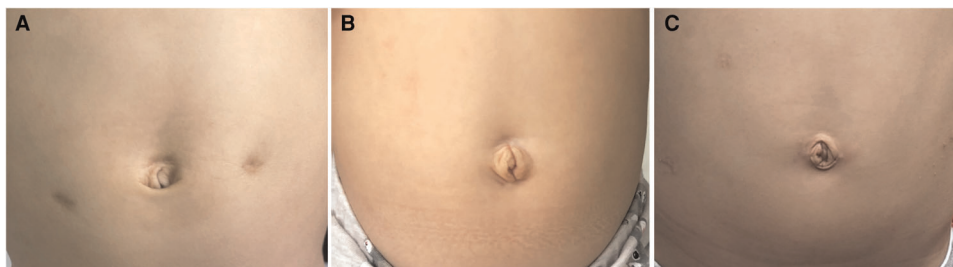
FIGURE 3 | The pictures of the umbilical region of infant undergone CLS (A), TUSS-LESS (B) and RS (C) 6 months after hospital discharge, respectively.

Many scholars have recognized the effectiveness of laparoscopic surgery for HD because of its small trauma, less bleeding, faster recovery compare to open operation and