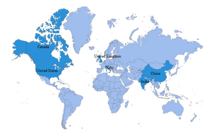
FIGURE 2 The map of the most prolific countries.

Computers in Biology and Medicine has the most cited articles in this field with an impact factor of 6.698. The next most-cited article was published in Radiology with an impact factor of 29.146. Based on the evidence, journals with a high impact factor