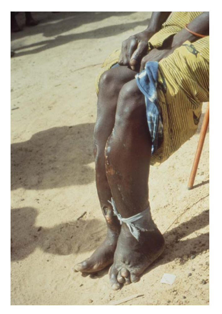
Figure 1. A 45-Year-Old Woman from the Ivory Coast with Tibial "Saber Deformity" as a Result of Late Tertiary Yaws Infection. A saber shin deformity is an abnormality of the tibia characterized by marked anterior bowing of the lower leg. This defect may be seen in some children with congenital syphilis and in patients with yaws. doi:10.1371/journal.pntd.0000275.q001

detrimental effects. For example, treatment for a pregnant woman with burntout yaws and one with active syphilis should be different, and assigning the wrong treatment may result in a negative outcome [7]. It is therefore not surprising that an important avenue of current research on treponematoses focuses on the in-depth analysis of the T. pallidum genome, in the attempt to identify and decipher determinants of host specificity, pathogenicity, and virulence among the different subspecies (e.g., [8,9]). Future advances in distinguishing between the subspecies using DNA polymorphisms may lead to serological tests that could be used in the field, facilitating disease control and eradication efforts by permitting the monitoring of its continued impact on populations.