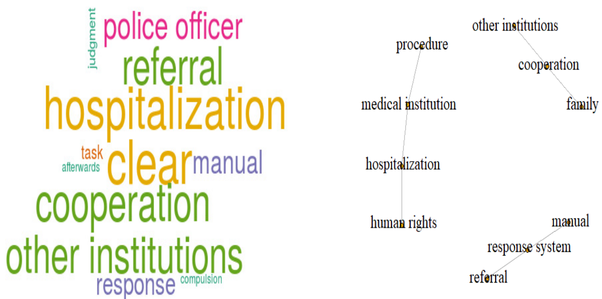
Figure 2. Word cloud analysis of suggestions for additions to the on-site response manual.

It was found that the words procedure-medical institution, medical institution-hospitalization, hospitalization-human rights are used together.