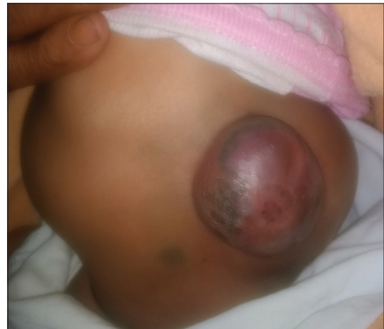
Figure 1: Swelling over the lumbosacral region

According to the National Birth Defect Prevention Study, risk factors for NTDs include family history of NTD, obesity, pregestational diabetes, low folate, and anticonvulsant use: Together, these factors account for less than 50% of NTD. [7] Folic acid has been observed to be critical in neural tube development. Our patient, the mother, was on multivitamin supplementation containing 0.2 mg of folic acid, for about two years until her pregnancy was detected. Hence, a deficiency of folate is less likely. There are studies which have shown that vitamin supplementation during the periconceptional period reduces the risk of NTD (OR \geq 1.7 ), while folic acid supplementation was slightly more protective against spina bifida. [8]