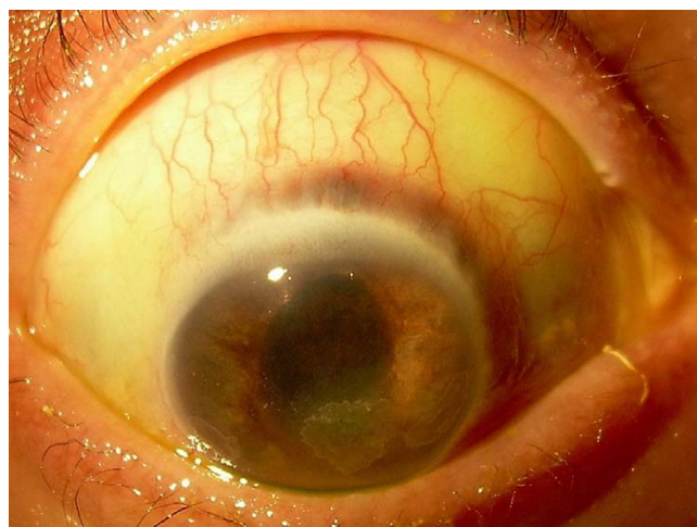
Figure 2 Colour photograph of the right eye indicating the initial thinning of the sclera at the superior limbus.