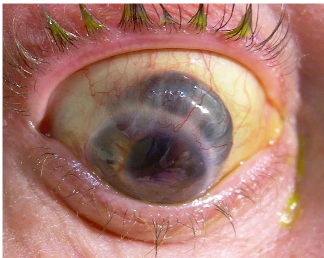
Figure 3 Colour photograph of the right eye showing the extensive thinning of the superior sclera and secondary anterior staphyloma formation.

tion of bilateral anterior uveitis with possible exposure to group A streptococci.