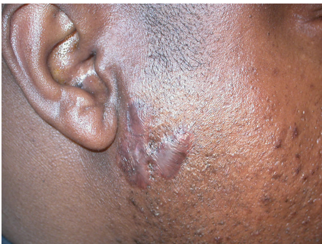
FIGURE 6 Scar 20 months later and three injections of Bleomycin