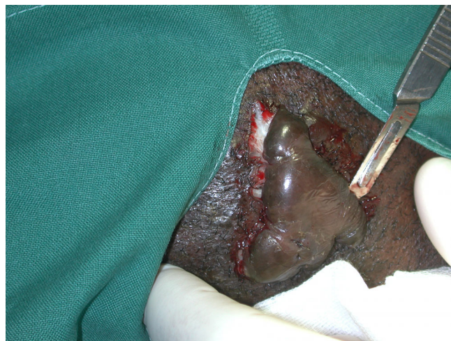
FIGURE 2 Shave surgery

The second step of the treatment consists of intralesional injections of diluted Bleomycin (15 U of Bleomycin are mixed with 20 cc of physiological serum used for dilution, and 20 cc of lidocaine with adrenalina 2%). The final solution is stored in the fridge. A total of 1–2 ml (depending of the size of the lesion) of the Bleomycin solution is