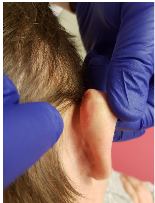
FIGURE 8 Scar 18 months later and two injections of Bleomycin