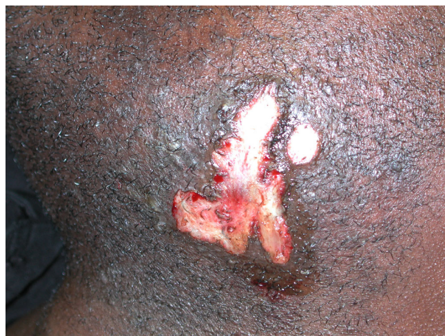
FIGURE 4 Scar at the end of shave surgery