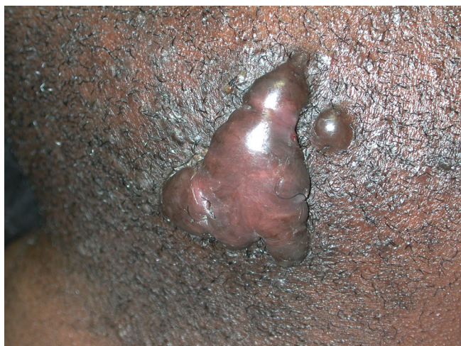
FIGURE 1 Keloid before shave surgery