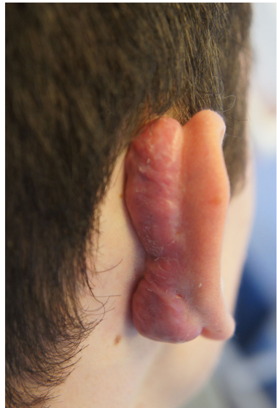
FIGURE 7 Keloid before treatment