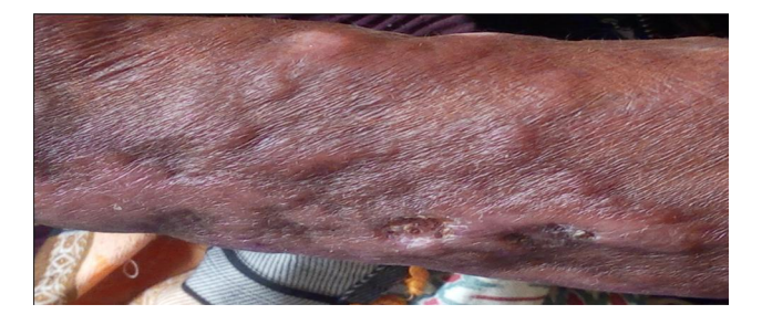
Figure 2 Disseminated CL. Affecting hands with characteristic multiple nodular lesions which crust at the center.

Leishmaniasis was suspected and he was sent to Amhara Public Health Institute, Bahir Dar City for parasitological investigation. Skin lesions were collected aseptically from nose, face and hands, and processed for parasitological examination. A smear was prepared directly from the