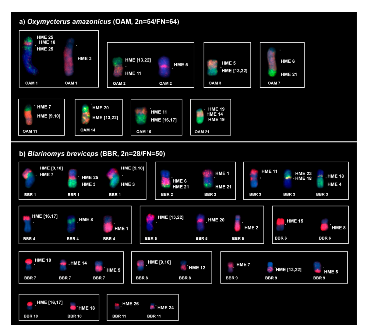
Figure 3. Chromosomal associations obtained from ( a ) Oxymycterus amazonicus (OAM) and ( b ) Blarinomys breviceps (BBR) using HME probes [23]. Each box corresponds to a chromosome pair that is shown in Figure 2 and exhibits chromosomal associations; for some chromosome pairs, single or multiple chromosomes are shown with different probes to exhibit that the HME whole-chromosome probes covered the entire chromosome. An asterisk indicates a centromere. HME whole-chromosome probes are shown as red (CY3), green (FITC), and yellow (CY3 + FITC); the counterstaining is blue (DAPI).