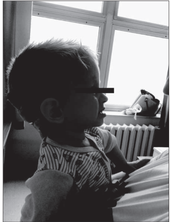
Fig. 2. Mandibular protrusion of the emerging cross-bite or undershot in a 2.5-year-old boy.

Ryc. 1. Zbaczanie żuchwy w kierunku dysfunkcyjnego lewego stawu skroniowo-żuchwowego u 2,5-letniego chłopca.