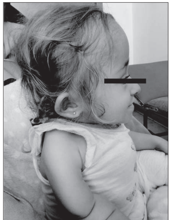
Fig. 4. Shortening of the cervical spine. Protrusion of the jaw with cross bite and undershot in a 7-year-old girl with dentin dysplasia.

Ryc. 3. Protruzja żuchwy ze zgryzem krzyżowym i przodozgryzem u 7-letniej dziewczynki z dysplazją zębiny.