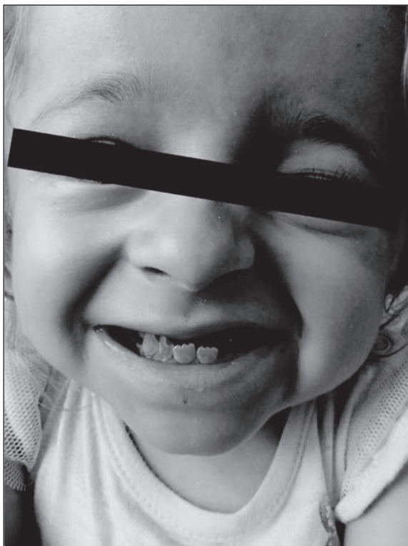
Fig. 3. Protrusion of the jaw with cross bite and undershot in a 7-year-old girl with dentin dysplasia.

Ryc. 2. Protruzja żuchwy z kształtującym się zgryzem krzyżowym i przodozgryzem u chłopca 2,5 roku.