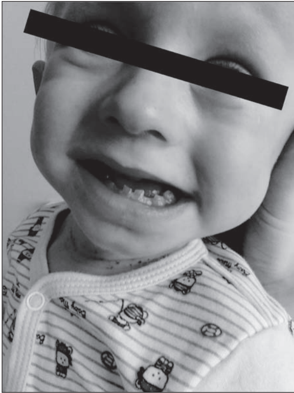
Fig. 1. Deviation of the mandible toward the dysfunctional left temporomandibular joint in a 2.5-year-old boy.

Ryc. 1. Zbaczanie żuchwy w kierunku dysfunkcyjnego lewego stawu skroniowo-żuchwowego u 2,5-letniego chłopca.