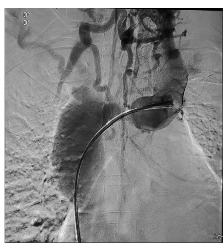
Figure 2: Digital subtraction angiography showing stenosis at the left brachiocephalic vein

The authors certify that they have obtained all appropriate patient consent forms. In the form the patient(s) has/have given his/her/their consent for his/her/their images and other clinical information to be reported in the journal. The patients