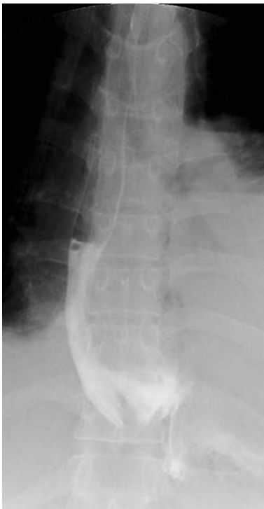
Fig. 2. An esophagogram revealed extravasation of contrast medium (Gastrografin) from the lower left esophagus to the mediastinal cavity.