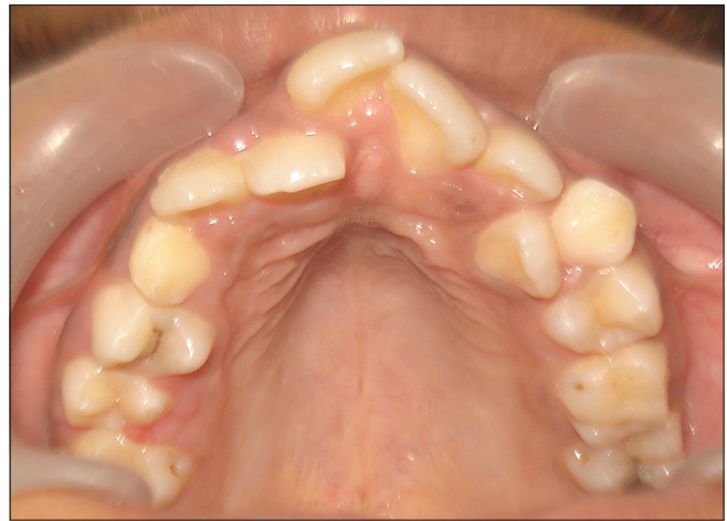
Figure 2: Maxillary arch