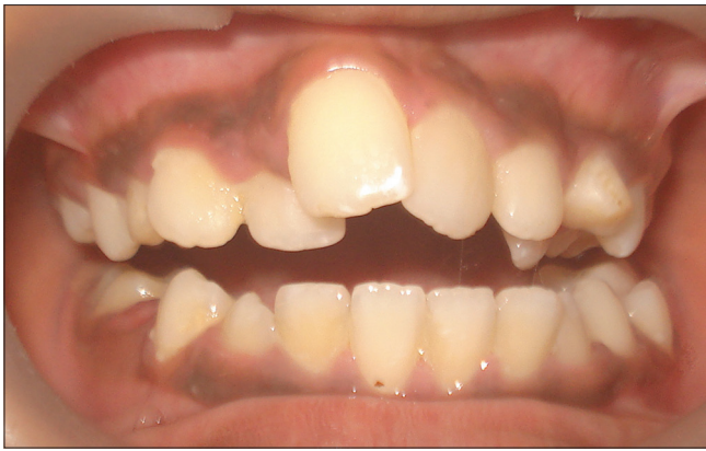
Figure 1: Anterior view of both arches