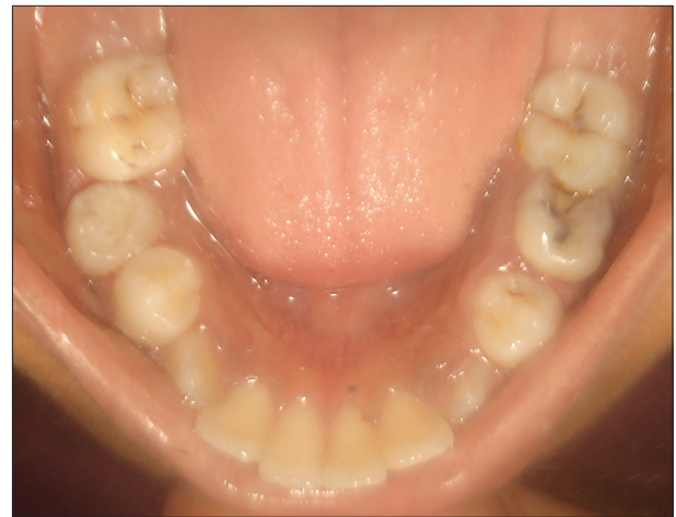
Figure 4: Mandibular arch

space, dentigerous cyst formation, and disturbances in adjacent permanent teeth such as ectopic eruption, diastema formation, pulp necrosis, pulp canal obliteration, root resorption, ankylosis and rotations. [4,6] Most supplemental teeth remain unerupted. [6] However, in the present case, the supplemental lateral incisors were erupted and had only resulted in ectopic eruption and rotations among the adjacent incisors. They did not cause any symptoms in the individual, which supports the fact that 75% of supernumerary lateral incisors located on both maxillary bones in the same position do not cause any symptoms. [13,14] If a supplemental tooth is present and erupted, it may be difficult to determine which tooth is supplemental and which are constituents of the normal dentition. [9] However, in the present case, they were categorized as supplemental lateral incisors, since their coronal dimensions closely matched with those of the lateral incisors. Supernumerary canines and lateral incisors are rare with low frequency of occurrence (2.8%) in comparison with other ST. [15] Multiple ST not associated with syndromes are found in rare conditions. [3,16-19] The patient in the present case did not have any mental retardation, abnormal facial appearance or any skeletal abnormalities suggestive of any syndrome, suggesting an autosomal dominant pattern of inheritance. Similar cases have been documented by many authors. [16,19-23] Nonsyndromic ST in the permanent dentition,