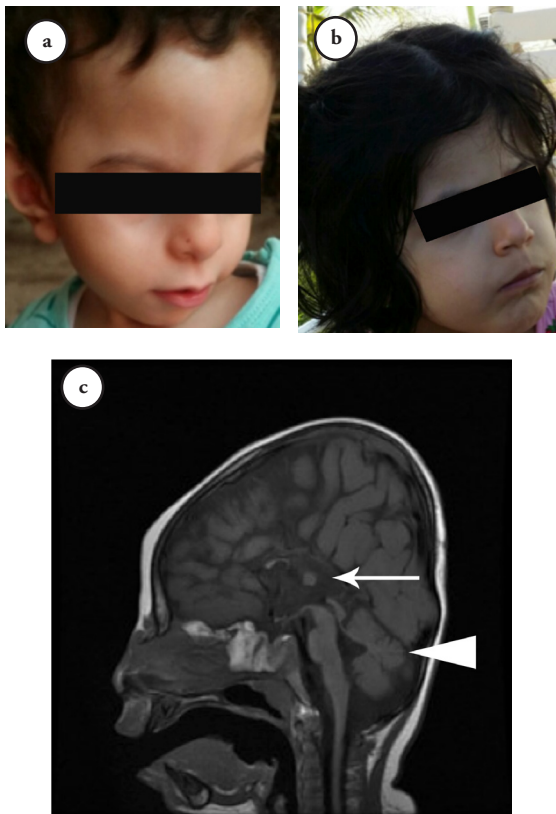
Figure 2 - Clinical features of the patients. a,b) The craniofacial features include dysmorphism in the form of wide forehead, hypotelorism, and upturned nose. c) The brain MRI indicates complete agenesis of the corpus callosum (white arrow) with inferior vermis hypoplasia (arrowhead).

abnormality in the formation of the corpus callosum, and various migrational disorders, such as dysplasia.