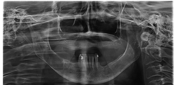
Fig. 1: Panoramic radiography showing radiolucent expansile lesion measuring 1.5 cm in diameter located in the right mandibular body.

the right mandibular body and of numbness in the right lower lip for about six months. The patient reported that she had undergone extraction of a molar tooth and after the procedure there was a significant worsening of the symptoms. Radiographic examination showed presence of a radiolucent lesion measuring 1.5 cm in diameter located in the right mandibular body (Fig. 1). The patient