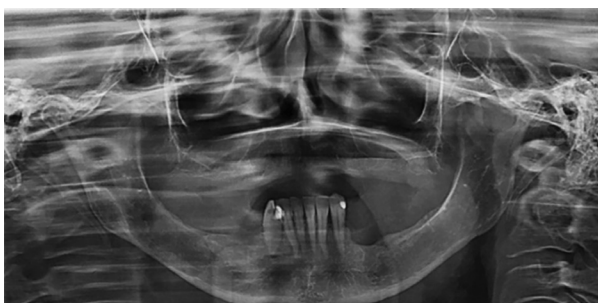
Fig. 3: Panoramic radiography after two years of follow-up showing absence of the lesion.

reported and denominated as hybrid peripheral nerve sheath tumours (HPNST) (19).