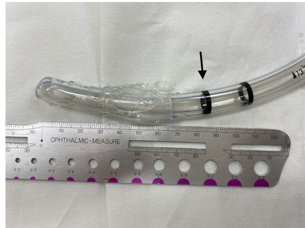
Fig. 3. Length of the end of the intubation tube for emergency surgical front of neck airway access. This picture shows the tip of a 6 mm intubation tube. It has a marker, 85 mm from the tip (arrow). The median distance from the cricothyroid ligament to the tracheal bifurcation was 105 (interquartile range, 90–110) mm among the 15 patients who underwent computed tomography imaging in this study. Thus, to prevent one-lung intubation, the intubation tube should be placed so as not to exceed this marker.

In this study, the most frequent adverse event was one-lung intubation. Although one-lung intubation can oxygenate the patient to some extent, it can cause pneumothorax due to excessive pressure on one lung. When a tube for general tracheal intubation is used in eFONA, one-lung intubation could be caused by inserting the tube too deeply. 13 This might also be caused by dislocation during patient transfer. X-ray is a simple method of detection and should be performed immediately after insertion. However, in some situations, portable X-rays are not immediately available, or the tube position might change even after imaging. Therefore, physicians managing the airway should always pay attention to the left–right difference in thorax elevation and auscultation. In particular, it should be carefully observed after tube