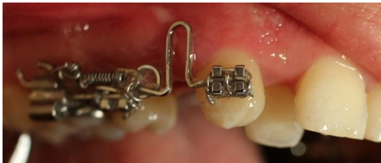
Figure 2. Test canine tooth under distalizing load applied by NiTi closed coil spring

Each tube containing paper strip was diluted with 250 µL of phosphate buffered saline and centrifuged for five minutes at ×2000g and 4 °C. After removing the paper strips, the supernatant was divided into two aliquots. The samples were then examined by an immunologist using ELISA (eBioscience, NY, USA) according to the kit manufacturer's instructions for determining the level of IL-6 and TNFα. After coloring, optical density of the solution was read at 450nm wavelength by a spectrophotometer. The total volume of both cytokines was determined in pictograms (pg). The concentration of each sample was determined by dividing the amount of cytokine by the sample volume (pg/µL).