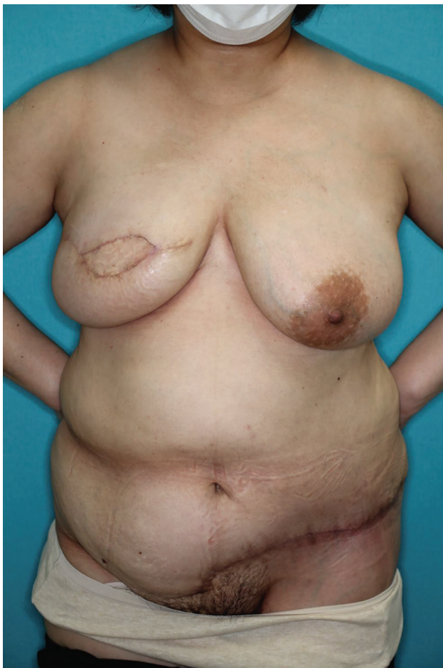
Fig. 3. Two months postoperative view of the patient after the surgery.

and deviation of the umbilicus, might be a problem. To obtain a good donor site shape, we use a specific design to make the appearance of donor site as good