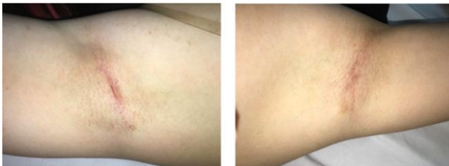
Figure 2: The scar in both side of patient's axillae 6 months postoperatively

The ugly scar is also a problem that causes patients' anxiety after surgery. In our group of patients, there was a predominance of flat scars (72.6%), followed by hypertrophic scars (24.2%), with only one axilla with contractive scars (Figure 2). During the followed period, we found a phenomenon that the scars in the right axillary fossa were more conspicuous than those in the left side. This may be attributed to the increased strains in the right side due to relatively more movements. The case of contractive scars occurred on a patient with hematoma, but the contractive degree was slight and acceptable.