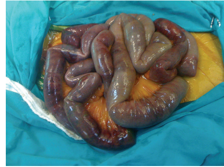
FIGURE 2: Intraoperative image of a gangrenous and necrotic bowel.

Among preoperative parameters, age ( P = 0.03 ), renal insufficiency ( P = 0.004 ), preoperative inotropic treatment >24 h ( P < 0.001 ), smoking ( P = 0.02 ), emergency cardiac surgery ( P = 0.01 ), PVD ( P = 0.04 ), LVEF <30 ( P = 0.002 ), cardiogenic shock ( P = 0.003 ), NYHA ( P = 0.006 ), and IABP