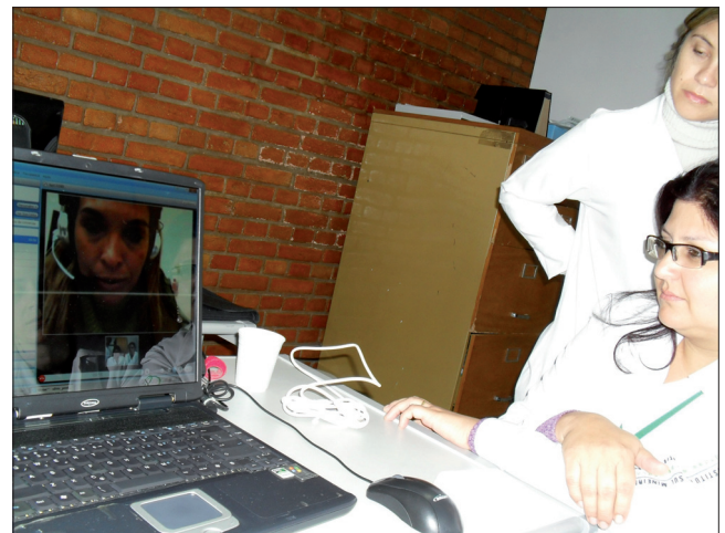
Figure 3. SU audiologist on the RU screen.