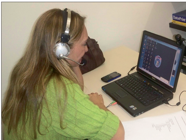
Figure 2. SU Audiologist.