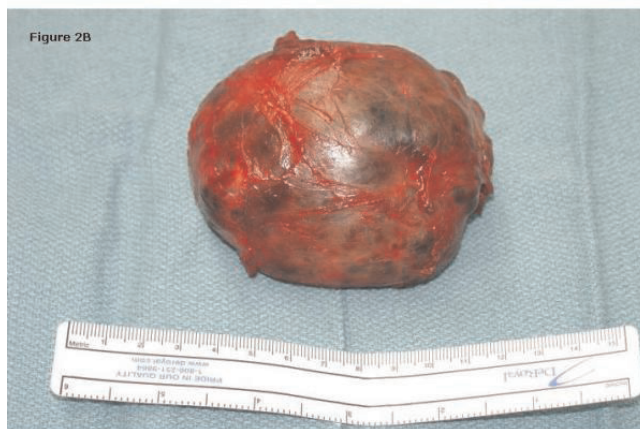
Figure 2. (A) Intra-operative photograph showing right posterior mediastinum. The black arrow points to a large goiter. The lung is compressed and held down with sterile gauze. (B) Gross pathologic specimen of goiter.

biopsy if the mass is safely accessible [4]. Thyroid scans can also be performed however they often fail to show the intrathoracic goiter [5].