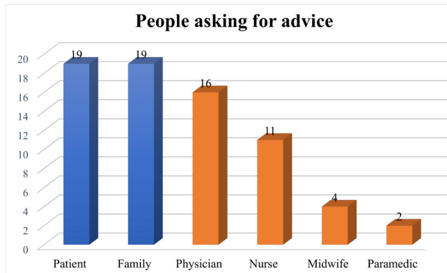
Figure 1 Categories of people who turn to chaplains for ethical advice in making difficult medical decision.

cancer treatment and another—limb amputation. Within the above categories, the questions most often asked of hospital chaplains concerned methods of birth control, discontinuation of persistent therapy and donating organs for transplantation—with 9%, 8% and 8% of chaplains, respectively, admitting that they encountered such questions several times a year (figure 2).