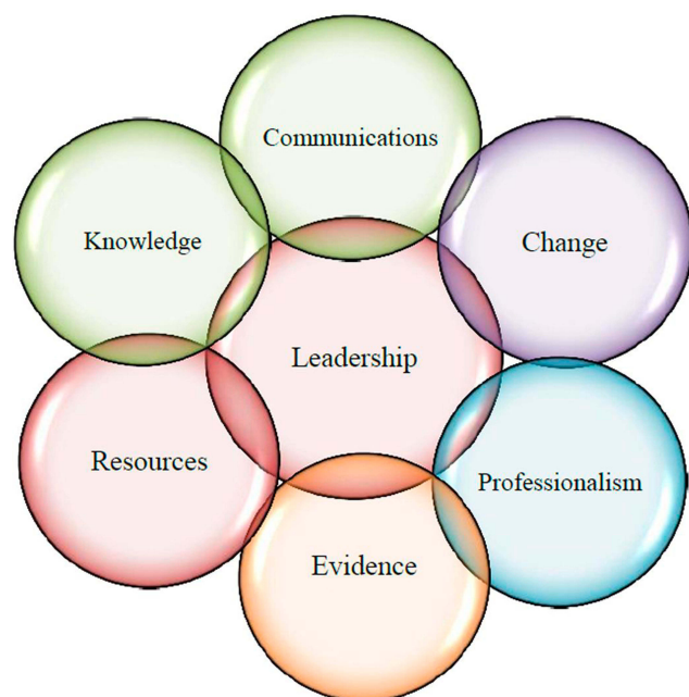
Figure 3 Final generated model of management and leadership competence for hospital managers.

behavioral items associated with the competency of professionalism, the systematic literature review and mapping confirmed the necessity of including professionalism as a separate competency for health service managers.