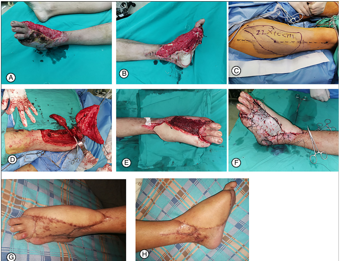
Fig. 3 Case 2. A male patient, 35 years old, suffered from serious injury of the left foot and ankle caused by a car accident, with multiple phalangeal fractures, calcaneal fractures, complicated with the right acetabular fractures and the right ulna and radius fractures. In a local hospital, the patient was treated with “injury control” to maintain the vital signs. At 1 week after debridement of the left ankle, he was transferred to our hospital. Following multiple times of debridement on the left foot, the right acetabular fracture, the ulnar and radial fracture were treated with open reduction and internal fixation, and the chimeric anterolateral thigh perforator flap was performed for reconstruction of this large area of soft-tissue defects of foot and ankle. (A, B) The appearance of foot and ankle before debridement. The first and fifth toes were absent, the distal injured bone and the tendon were exposed. The wound surface, approximately 22 cm × 15 cm in size, was involved with the plantar weight-bearing site and the dorsum of the foot. (C, D) The chimeric anterolateral thigh perforator flap was designed and created. (E, F) The harvested skin flap and muscle flap were arranged in a fan shape to cover the wound surface. The vascular pedicle at the donor site was anastomosed with the anterior tibial artery and vein, as well as the great saphenous vein. Medium-thickness skin grafting was performed on the surface of the muscle flap. Conventional microsurgical procedures, such as anti-inflammation, anti-spasm and anti-coagulation, were conducted after operation. At postoperative 7 days, all flaps and skin graft sites survived. (G, H) During postoperative 6-month follow-up, the flap and skin graft sites had excellent appearance and no deep infection was observed.

vascular supply area. At least one perforator flap is included in these independent tissue flaps, and the nutrient vessels originate from the same primary blood vessels. Anastomosing a group of vascular pedicle (primary blood vessels) can reconstruct the blood circulation of multiple independent