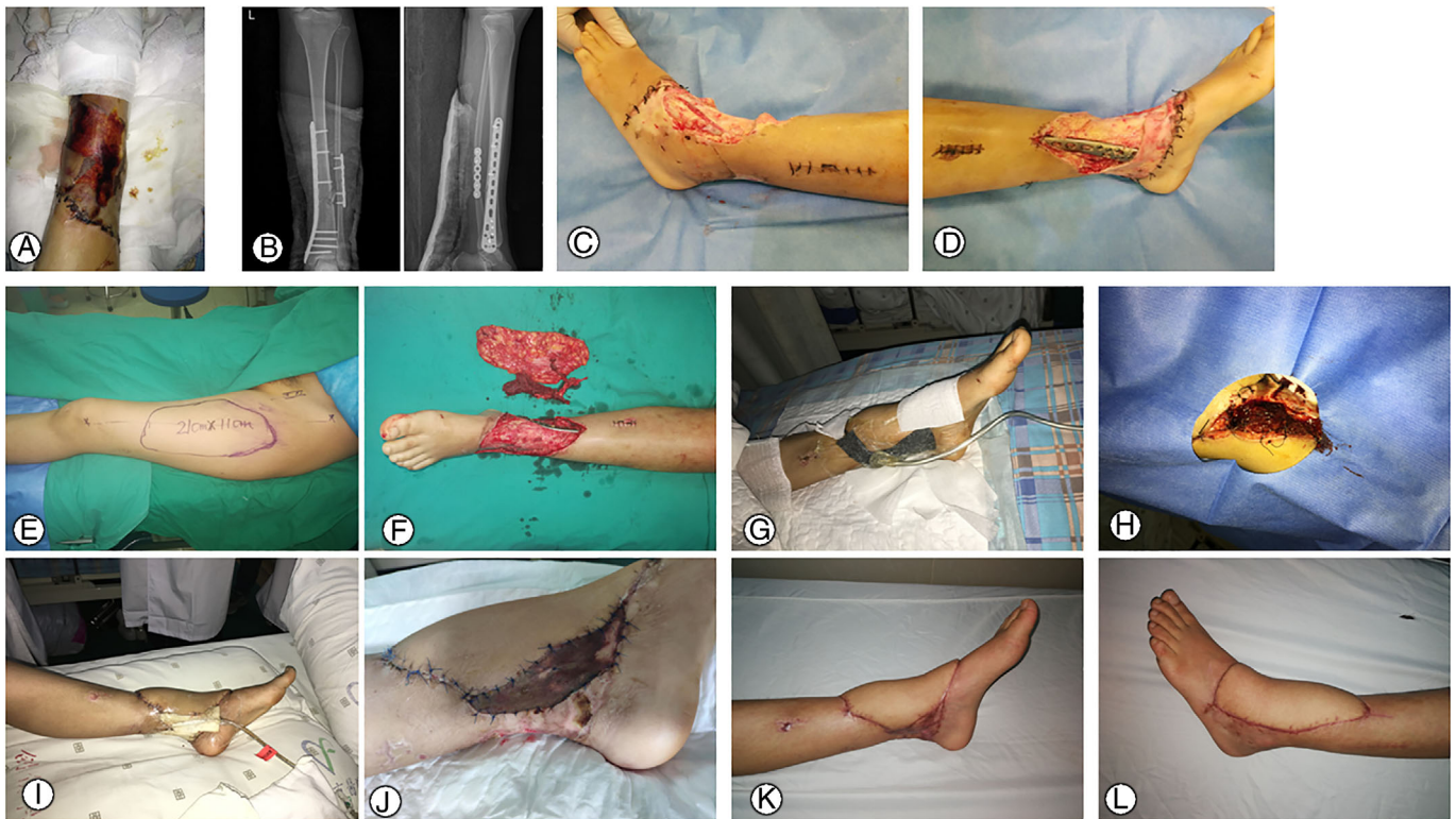
Fig. 2 Case 1. A 24-year-old female patient with open fracture of distal tibia and fibula complicated with soft-tissue contusion caused by a traffic accident underwent debridement, fracture reduction and internal fixation in a local hospital and wound closure. At postoperative 1 week, she was transferred to our hospital due to secondary ischemic necrosis of the skin at the injured site. The larger deep wound was repaired with the chimeric anterolateral thigh perforator flap. (A, B) Appearance photos and anteroposterior and lateral radiographs of ankle joint. (C, D) After the debridement of the distal necrotic lesions of the ankle, tendon, tibia and internal fixator were exposed, with a total wound area of approximately 20 cm × 14 cm. (E, F) The chimeric anterolateral thigh perforator flap were designed and cut out. (G) The skin flap and muscle flap were arranged in a fan shape to cover the wound surface, the vascular pedicle at the donor site was anastomosed with the anterior tibial artery and vein, and the surface of muscle flap was covered with negative pressure. Postoperative microsurgical therapies, such as anti-inflammation, anti-spasm and anticoagulation, were performed as needed. (H, I) At postoperative 5 days, negative pressure on the muscle flap was removed. Blood oozed from the muscle flap. Full-thickness skin grafting was performed and the skin grafting site was covered by vacuum sealing drainage. (J) At 1 week after skin grafting, all flaps and skin grafting sites survived. (K, L) At postoperative 6 months, the flap and skin grafting site on the muscle flap had excellent appearance and no deep infection occurred.

drainage failed to provide delay in definitive free flap reconstruction while providing temporary effective wound coverage. The functional recovery of the foot and ankle is correlated with excellent flap coverage. In general, flap should be fully utilized to cover the weight-bearing site and the exposed sites of deep bone, tendon, nerve and other tissues to provide the maximum tendon sliding and to obtain the premium functional recovery 20 . However, when the wound exceeds a certain range, it is challenging to achieve a satisfactory effect with a single large flap. Alternatively, simultaneous use of two or more combined flaps can be used to repair a large wound while the increased complexity of the procedure would also elevate the surgical risk and aggravate the injury at the donor site. That is to say, once the repair operation fails, it often causes injuries at both the donor and acceptor sites, even leading to amputation.