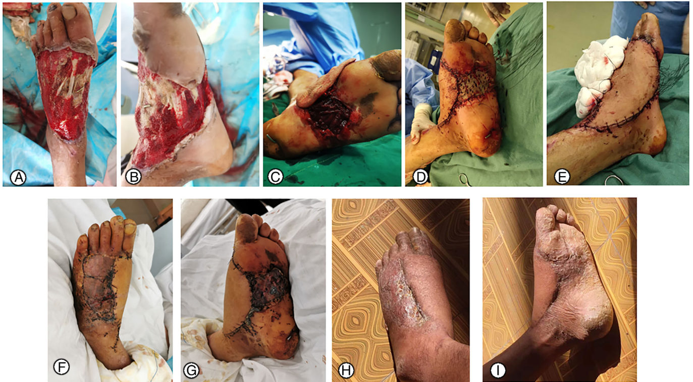
Fig. 4 Case 3. A male patient, 38 years old, suffered from serious injury of the right foot by a car accident with multiple metatarsal fractures and dislocation. (A, B) The appearance of the foot wound with exposing the local tendon and bone. The wound involved the medial plantar area and dorsum of foot. It was irregular about 18 cm × 19 cm. (C, D, E) The chimeric anterolateral thigh perforator flap was designed and cut. Skin flap and muscle flap were arranged in a fan shape to cover the wound surface in the front of the dorsum and the medial plantar. The vascular pedicle of the donor site was anastomosed with the anterior tibial artery and vein and great saphenous vein. Skin grafting was performed on the surface of dorsolateral foot wound and muscle flap (F, G) All flaps and skin grafting areas survived 10 days after operation. (H, I) Six months follow-up showed that the appearance of flap and skin graft area was good, and no deep infection occurred.

the chimeric muscle flap are both stemmed from the descending branch of the lateral circumflex femoral artery. Only one group of blood vessels needs to be anastomosed intraoperatively to reconstruct the blood circulation of multiple independent tissue flaps 10 . Therefore, the chimeric anterolateral thigh perforator flap not only incorporates the advantages of perforator flap, but also possesses abundant blood supply and potent anti-infection capability of the muscle flap. The flap can be utilized parallel to the chimeric muscle flap, in a spread fan shape to repair different wounds in a flexible way. In particular, the extensibility of the muscle flap provides wider coverage of deep tissues. In this study, we adopted this technique to repair large areas of wounds to the foot and ankle, instead of the use of a single large flap or multiple combined flaps. This technique allowed excision of the flap within the range of direct suturing, thereby minimizing the injury at the donor site. Due to denervation after the grafting of the harvested muscle flap, the muscle site shrinks after the operation and the appearance is not swollen in the advanced stage. Therefore, skin grafting on the muscle flap