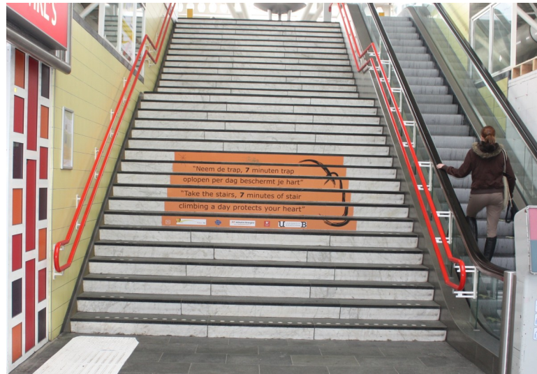
Fig 2. Intervention design based on Miro installed on the stairs in Leiden, the Netherlands.

https://doi.org/10.1371/journal.pone.0220308.g002