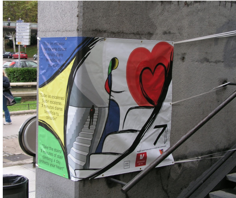
Fig 1. Intervention poster with message at the outdoor site in Monjuic, Barcelona.

https://doi.org/10.1371/journal.pone.0220308.g001