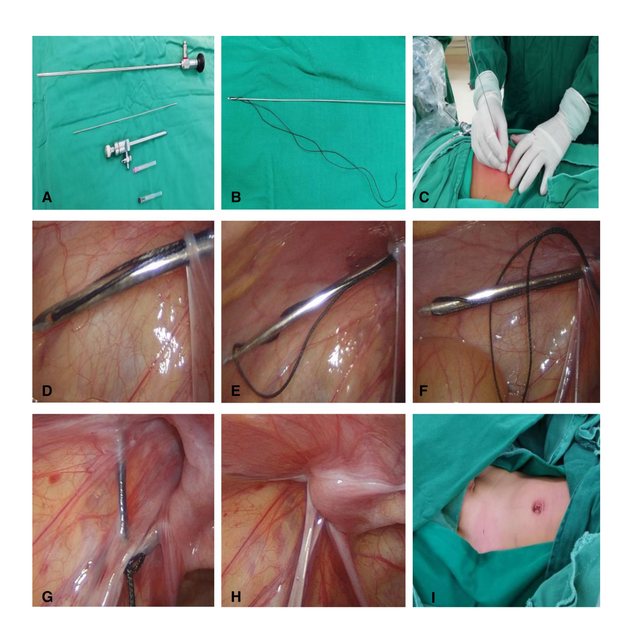
Fig.1 The equipment, materials and procedure of the surgery. \mathbf{a} The equipment and materials. \mathbf{b} The hernia needle with a non-absorbable silk suture. \mathbf{c} The specialist was operating. \mathbf{d} The needle inserted into abdominal cavity. \mathbf{e} The needle with suture-1 withdrawn and left

The required equipments and materials for our procedure were as follows (Fig. 1a): a Wolf or Olympus laparoscopic system, a 30° pediatric laparoscopic lens 5 mm in diameter, a trocar 5 mm in diameter, a hernia needle 1.3–1.5 mm in diameter with a hole in one flat, blunt terminal. This could be a processed Kirschner pin with a hole in the flattened and blunted terminal, threaded with a size 4 or 7 non-absorbable silk suture (Fig. 1b), a size 7 needle for pinpoint, and a size 12 needle for incision.