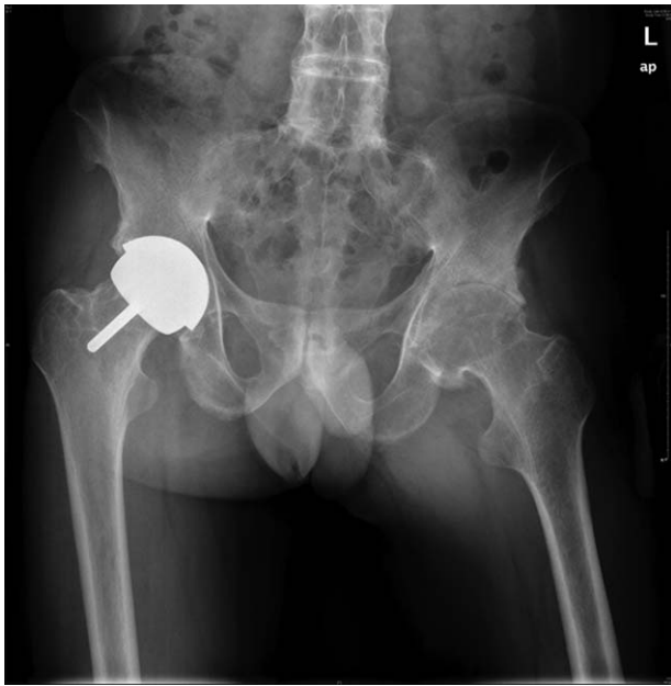
Figure 1. The radiograph of the pelvis of the patient shows bony ankylosis of the lumbar vertebra and bilateral sacroiliac joints. The right hip underwent hip resurfacing 5 years ago, and the left hip was narrowing.

30 degrees, extension 0 degrees, adduction 10 degrees, abduction 20 degrees, and external rotation 20 degrees. Laboratory examinations were in normal range. The routine blood examination showed: hematocrit (HCT) 43.1%, hemoglobin (HGB) 143 g/L; coagulation function: prothrombin time (PT)=14.1 seconds, activated partial thromboplastin time (APTT)=38.8 seconds, thrombin time (TT)=15.0 seconds, international normalized ratio (INR)=1.1. The C-reactive protein (CRP) was 13.4 mg/L, and the erythrocyte sedimentation rate (ESR) was 16 mm/H. A preoperative X-ray showed that the left hip had bony ankylosis and the right side of the hip was replaced (Fig. 1).