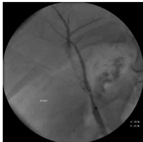
Figure 2 Bile leak above the duct anastomosis