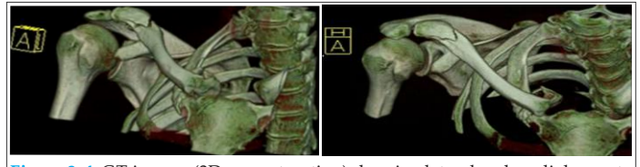
Figure 3, 4: CT images (3D reconstruction) showing lateral and medial aspects of the clavicle

A literature review using Scopus with "clavicle" AND "bipolar"