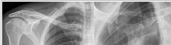
Figure 1, 2: Pre-operative radiographs

was assessed according to ATLS protocol and sent for imaging. Plain radiographs identified a left first metacarpal (MC) fracture and a bipolar fracture of his right clavicle (Fig. 1,2). He was initially immobilized in a thumb spica cast for the 1st MC fracture and treated in a broad arm sling for the right clavicle fracture.