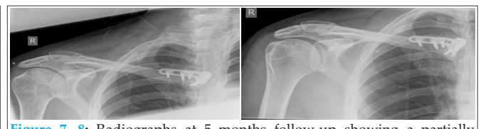
Figure 7, 8: Radiographs at 5 months follow-up showing a partially radiologically healed lateral fracture (clinically healed by fibrous union) and medial fracture instrumented with a contoured plate and screws