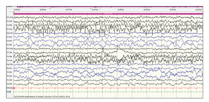
Figure 3: Sixty seconds after onset, well-developed ictal rhythm over the left posterior head regions