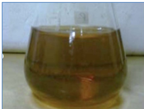
Figure 2: The image depicts the preparation of Supercritical fluid - 250 g of tulsi powder taken and soaked in 1000 ml of ethyl alcohol for 48 hours.