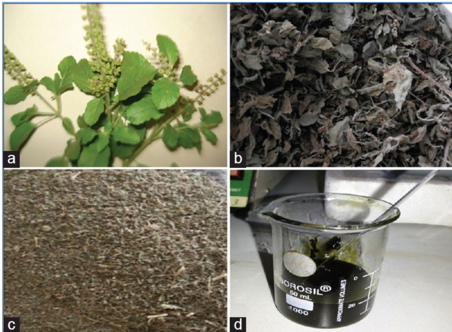
Figure 1: The image shows (a) Tulsi leaves; (b) dried Tulsi leaves; (c) powdered tulsi and (d) Tulsi gel