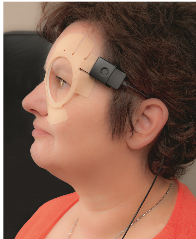
Figure 2 The sensor transmits the information to an antenna which is connected to a portable recorder.

is not possible during the CLS wear, making simultaneous validation of the registered spikes difficult. 65