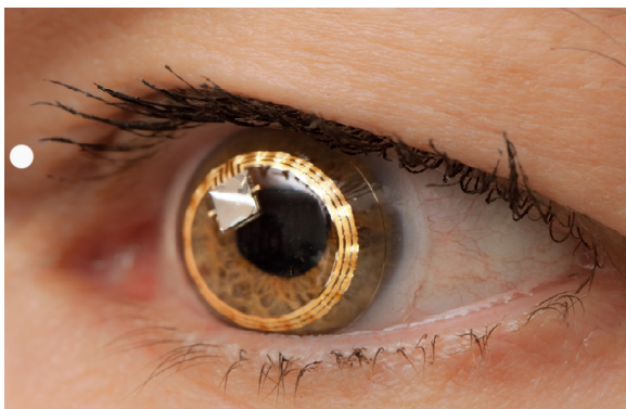
Figure 1 Contact lens sensor (SENSIMED Triggerfish®) on the eye.