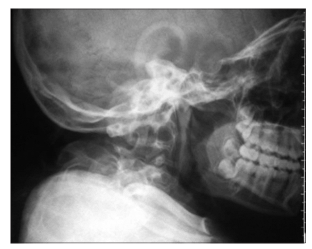
Figure 1b: X-ray neck (lateral view)