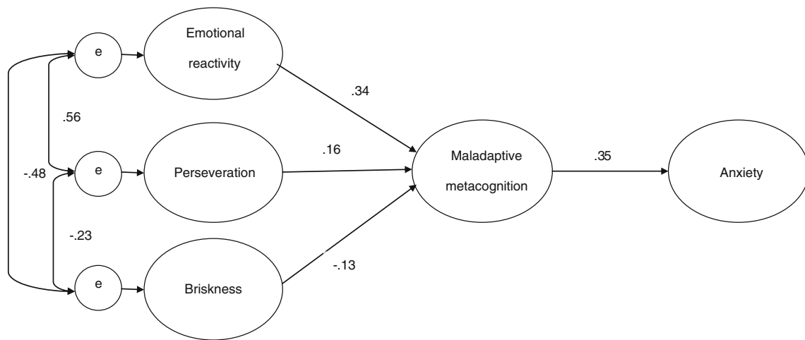
Fig. 1 Structural equation model with the standardized path coefficients between three temperament traits, maladaptive metacognition, and anxiety. Note: e error

predictive of this type of negative belief, which in turn was predictive of anxiety ( b = .32 ). The ER-anxiety and PE-anxiety paths were not included, implying full mediation of metacognition, the effects being significant (ER: z = 3.98, p < .001 ; PE: z = 2.41, p = .016 ).