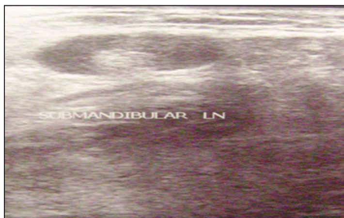
Figure 3. Ultrasonographic image showing cellulitis of buccal and canine spaces.

USG guided needle aspiration was then carried out to conform the fluid collection and pus sent for culture and sensitivity. After diagnosis statement surgical and medicament treatment was applied.