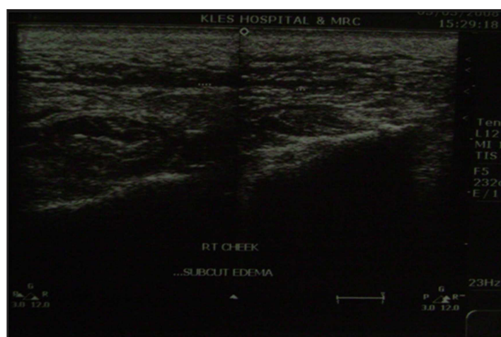
Figure 2. Ultrasonographic image showing cellulitis of buccal and canine spaces.