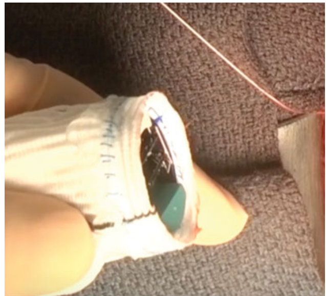
Fig. 2 A composite graft (Dacron graft with sutured mechanical valve) with a short skirt.

However, our technique differs from these previous descriptions. Our technique has two important distinctions as follows: (1) the composite graft is created with a short skirt (3–4 mm) and (2) the sutures overlap on the graft but not on the aortic annulus (► Figs. 2, 3 ). The sutures are overlapped 7only on the graft due to shear forces potentially created by overlapping sutures on the annulus which may induce the dissection of the annulus if the sutures are tied too tightly. The prosthetic grafts have sufficient tolerance to the overlapping shear forces. Compared with the previously proposed hemostatic modifications of the proximal anastomosis, 6–8 our technique does not call for the use of additional material or adjunctive sutures, which can lengthen cross-clamp and CPB times, potentially canceling out the effect of the technical modification itself by impairing coagulation and promoting postoperative morbidity.