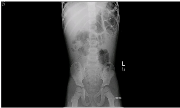
Figure 1 Abdominal X-ray.

abdominal region was done to rule out any anatomical or positional abnormalities of the intestine, with suspicion of a partial obstruction in the small intestine. The CT revealed no abnormalities either. The child was withheld oral food and fluid (nil per os), and nasogastric tube was kept on low volume suction. Barium meal and follow through were hence scheduled, which revealed growth of intestinal worms in the upper intestine at various sections, which were found to be the cause of partial intestinal obstruction, as shown in Figure 2. The number of worms found was quite low, leading to the inability of reaching a definitive diagnosis earlier. Upon resolution of the patients vomiting bouts and the development of healthy bowel sounds, he was initially started on a liquid diet and his diet was progressed further. Albendazole was given as an anthelmintic and the patient was discharged. Follow-up after 6 days showed complete resolution of symptoms with confirmation that the worms had been passed during defecation. This study was conducted