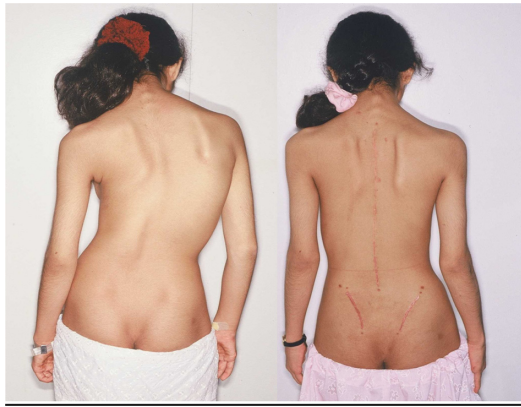
Figure 3 Thirteen-year-old female before and after correction and fusion with posterior iliac crest grafting.

and functional outcome using Spearman's rank correlation. A P -value of less than 0.05 was taken to be significant.