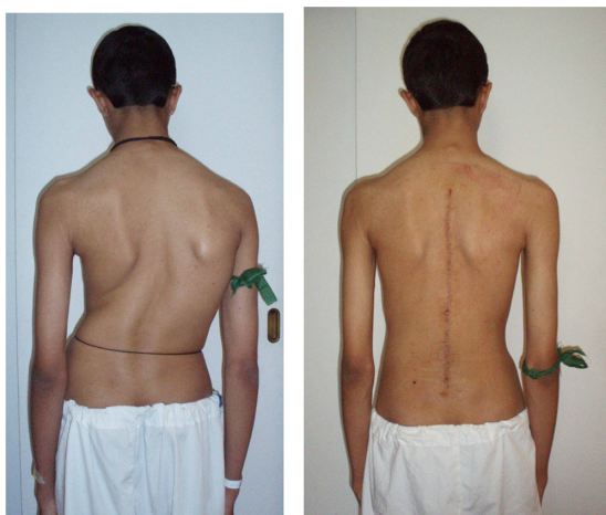
Figure 4 Fourteen-year-old boy after posterior correction and fusion using local bone.

There was a positive correlation between a high preoperative Cobb angle and subsequent improvement in postoperative mental and functional scores. Patients with large Cobb