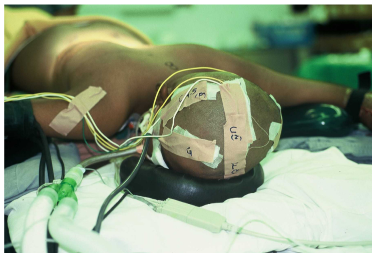
Figure 2 Setup for intraoperative somatosensory evoked potentials monitoring, which involves stimulating electrodes attached to the feet and recording electrodes on the scalp.

The data was analyzed using SPSS (SPSS version 14.0; IBM, Armonk, NY). Analyses were performed for correlations between the Cobb angle, percentage improvement,