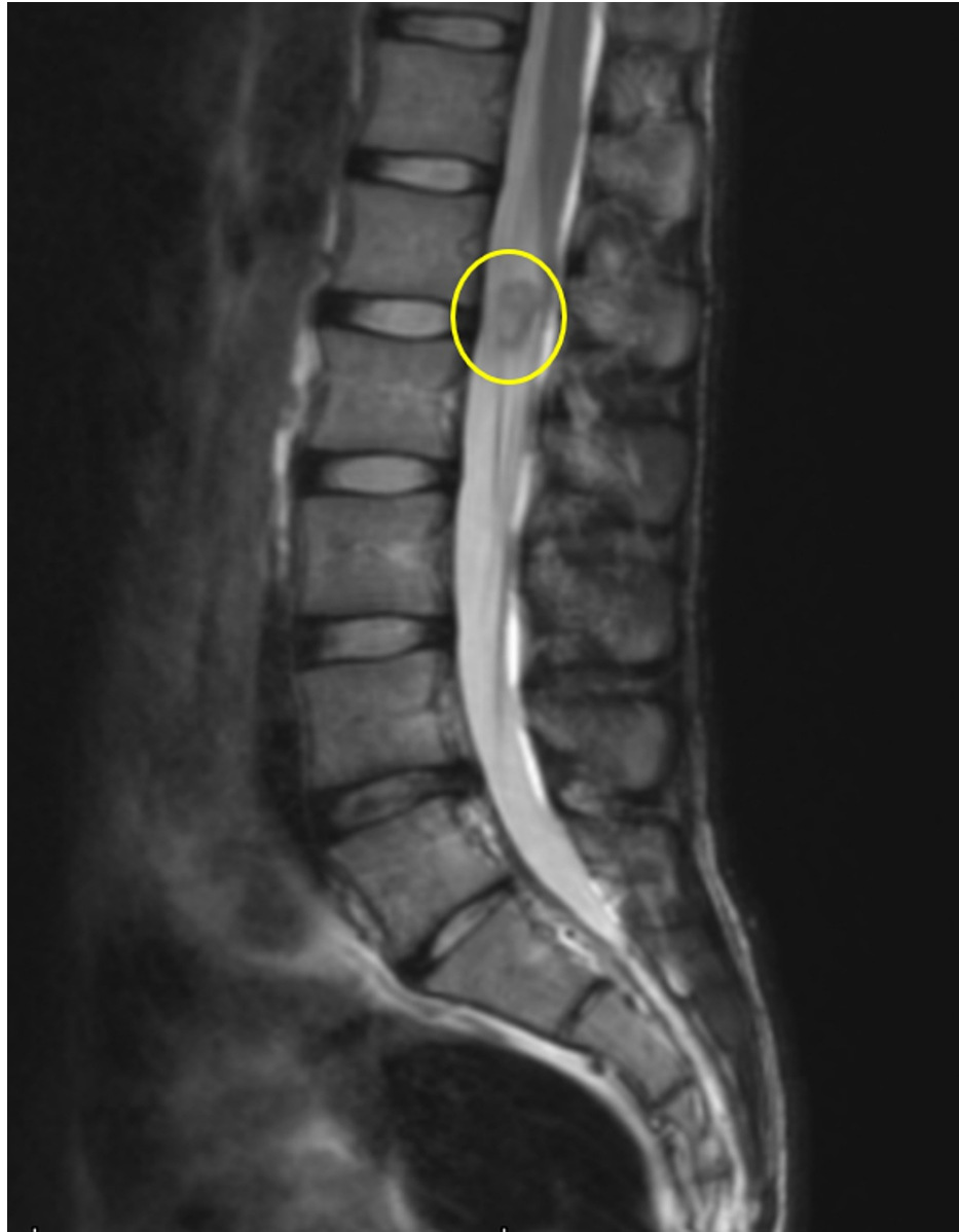
FIGURE 1: Possible schwannoma.

A redemonstration of a 1.1 cm intradural extramedullary lesion at the L2-3 level within the left aspect of the thecal sac lesions in the adjacent cauda equina nerve roots favored to represent a schwannoma. This does not appear appreciably changed in size or appearance over the last year.