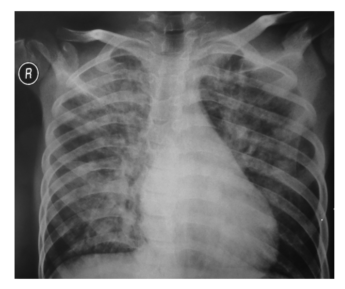
Fig. 2. Acute pulmonary edema (after 7 h of Leiurus abdullahbayrami envenomation).