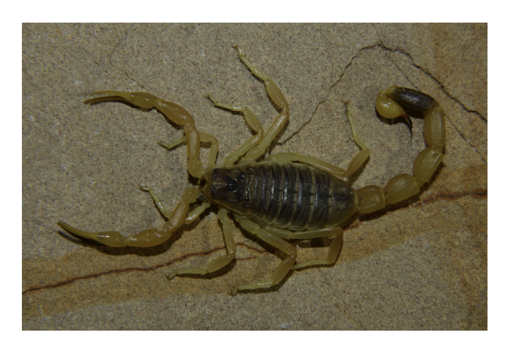
Fig. 1. Leiurus abdullahbayrami (Scorpiones: Buthidae).