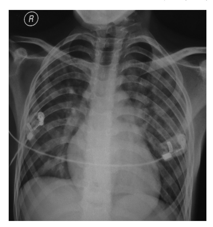
Fig. 4. Significant healing on chest X-ray findings (after 18 hours of Leiurus abdullah-bayrami envenomation).

the 14th day of hospitalisation with oral enalapril and furosemide treatments and to be called for outpatient treatment controls. After 30 days of his hospitalisation his findings became normal in the control echocardiographic examination. Hence, he get called for control after 2 months.