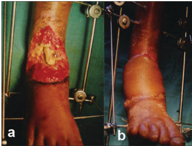
Figure 3: (a) Clinical photograph shows compound fracture lower end both bones leg involving the ankle mortise. (b) Postoperative cross-leg flap in place

the unavailability of recipient vessel near the defect. There is significant difference in the failure rate between those patients having free flap less than three days from the time of injury and those having flaps more than three days to three months after the injury. 10 Once the free flap is failed, there is limited option available. After failed free flap, the rate of amputation of extremity varies from 22 to 57% in different studies. 11-13 Despite failed free flap, majority of the extremities can be salvaged by split skin graft and local flaps, but intermittent wound breakdown and drainage of extremities remained major problems. This indicates that loss of a free flap significantly affects the potential to salvage a lower extremity. 14 However, after previous failed free flap, if the same indication remains, a second free flap is not a contraindication, but it again carries a risk of failure. Patients with electrical burn, locally diseased arterial tree especially in cases of diabetes and Buerger's disease, and in patients who had radiotherapy will have higher complications in terms of arterial and venous thrombosis. In cases of single vessel limb end-to-side anastomosis can be performed but there is always a chance of vascular thrombosis with subsequent threat to limb viability.