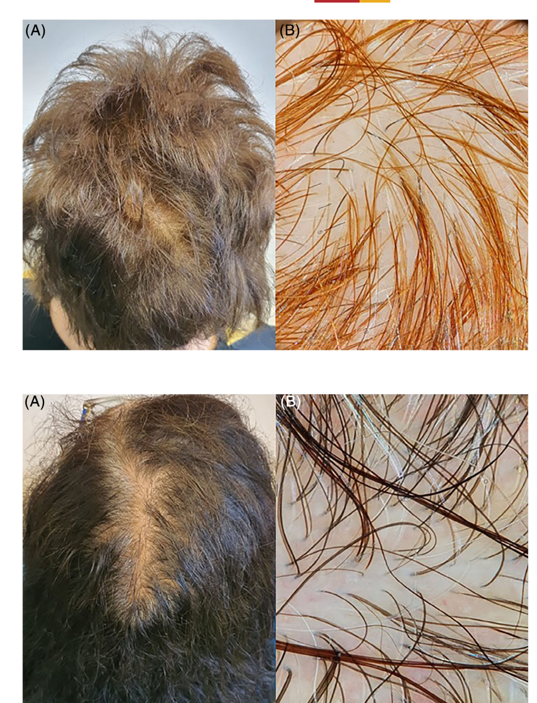
FIGURE 3 A, Diffuse reduced hair density without regression to the temporal regions. B, Trichoscopy showed a mild reduction in hair density with some with some hair of reduced thickness

FIGURE 2 A, Hair thinning and reduced central hair density. B, Trichoscopy showed a mild reduction in hair density without any other pathological findings