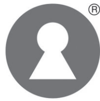
The Nordic Keyhole